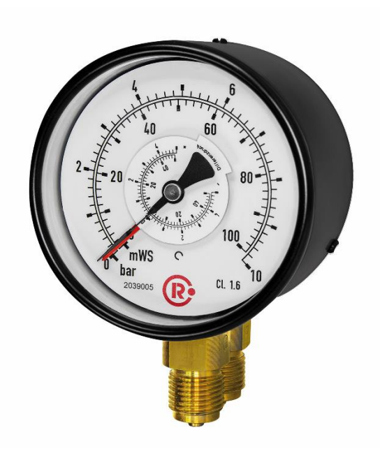
Differential pressure gauge